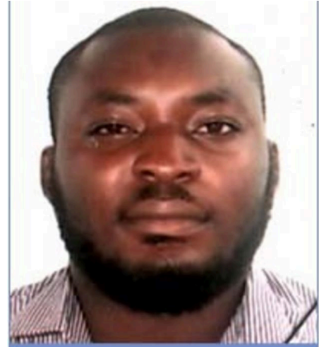
Photograph taken in 2014