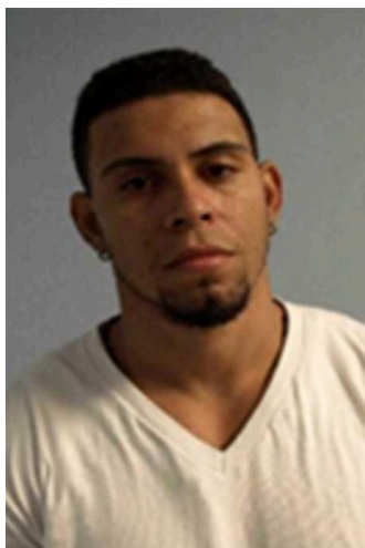
Photograph taken in March of 2012