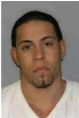
Photograph taken in December of 2012