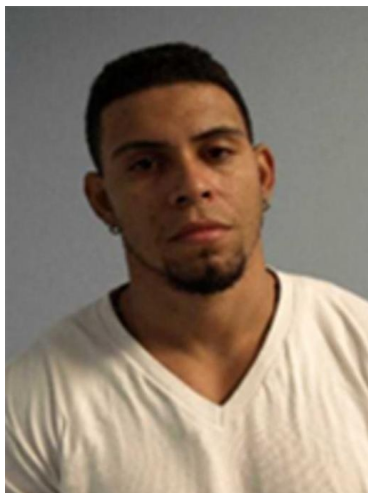
Photograph taken in March of 2012