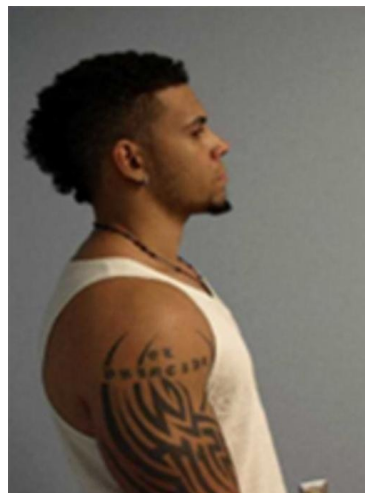
Photograph taken in December of 2012