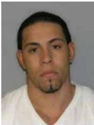
Photograph taken in December of 2012