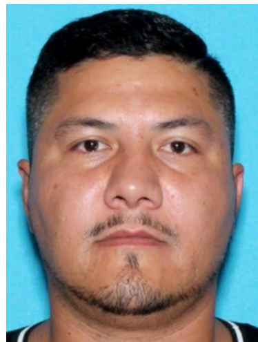
Photograph taken in 2015