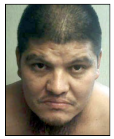
Photograph taken in 2017

Conspiracy to Provide and Conceal Material Support and Resources to Terrorists; Conspiracy to Commit Acts of Terrorism Transcending National Boundaries; Conspiracy to Finance Terrorism; Narco-Terrorism Conspiracy