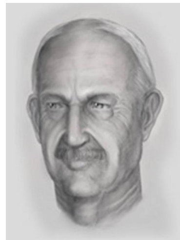
Photograph age enhanced in 2011