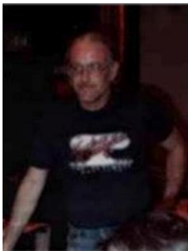
Photograph taken in 1984

Unlawful Flight to Avoid Prosecution - Criminal Attempt With Intent to Commit the Crime of Involuntary Deviate Sexual Intercourse, Criminal Solicitation With the Intent of Promoting or Facilitating the Commissions of the Crime of Involuntary Sexual Intercourse, Indecent Assault, Corruption of a Minor, Endangering the Welfare of Children