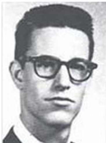
Photograph taken in 1963