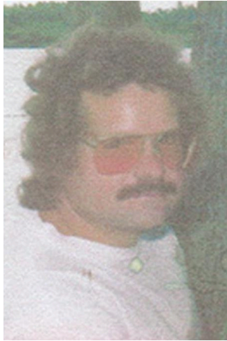
Photograph taken in 1998