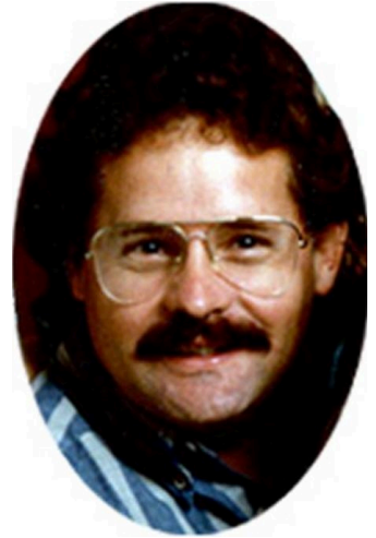
Photograph taken in 1995