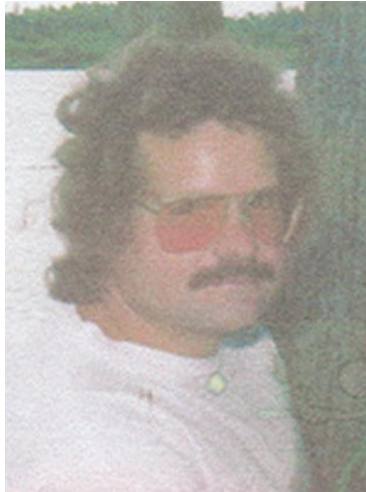
Photograph taken in 1998