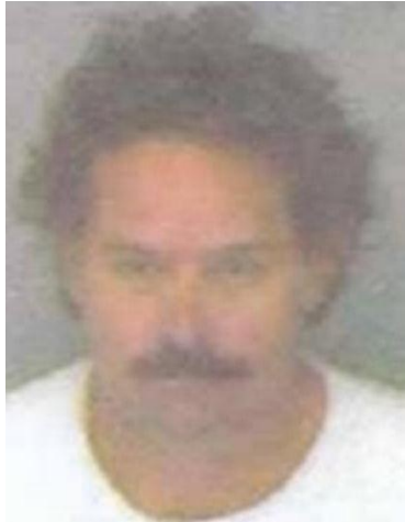
Photograph taken in 1998

Unlawful Flight To Avoid Prosecution - Lewd And Lascivious Behavior On A Child; Failure To Appear