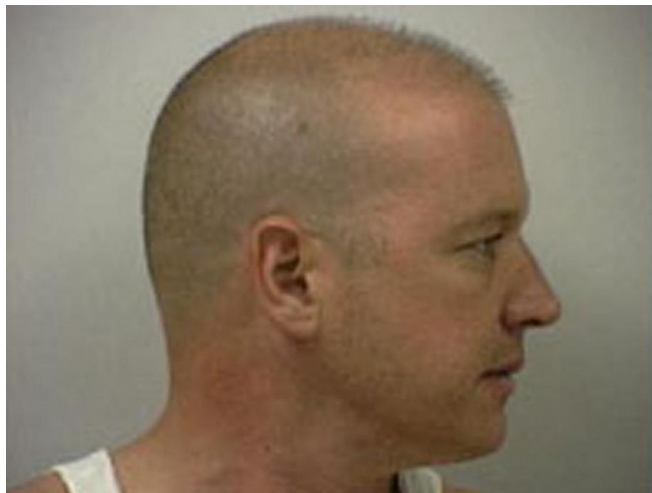
Photograph taken in 2007