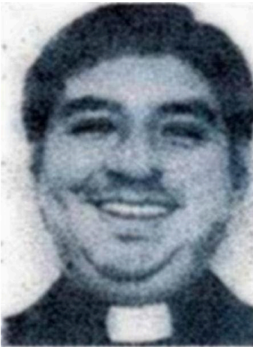
Photograph taken in 1991

Unlawful Flight to Avoid Prosecution – Lewd and Lascivious Act with a Child Under Fourteen