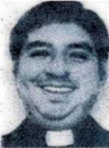
Photograph taken in 1991

Unlawful Flight to Avoid Prosecution - Lewd and Lascivious Act with a Child Under Fourteen