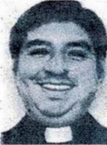
Photograph taken in 1991

Unlawful Flight to Avoid Prosecution - Lewd and Lascivious Act with a Child Under Fourteen