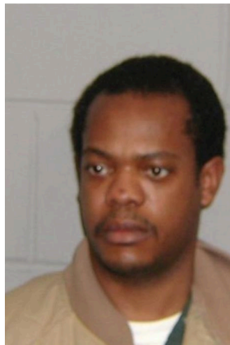
Photograph taken in 2002