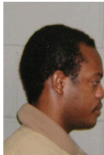
Photograph taken in 2002