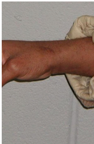
Photograph taken in 2002 - Scar on wrist