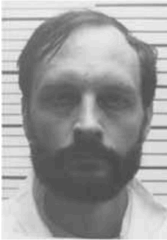
Photograph taken in 1992

Unlawful Flight to Avoid Prosecution - First Degree Assault On A Law Enforcement Officer