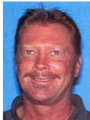
Photograph taken in 1999