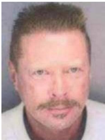
Photograph taken in 2002

Unlawful Flight to Avoid Prosecution - Failure to Appear (Sexual Assault - 17 Counts)