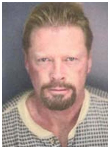
Photograph taken in 2002