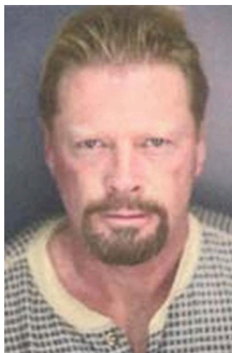
Photograph taken in 2002