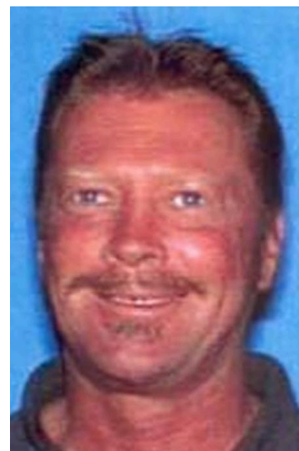
Photograph taken in 1999