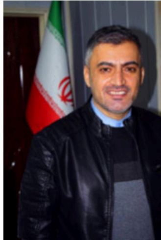
Photograph taken in 2020