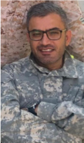
Photograph taken in 2021

Use of Interstate Commerce Facilities in the Commission of Murder for Hire; Providing and Attempting to Provide Material Support to Terrorists