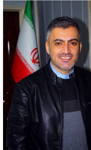
Photograph taken in 2020