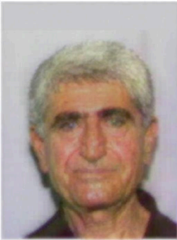
Photograph taken in 2004