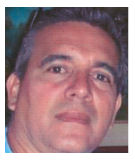
Photograph date unknown