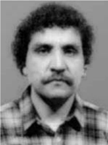
Photograph taken in 1980

Unlawful Flight to Avoid Prosecution - Armed Robbery; Kidnapping, Theft, Aggravated Battery, Failure to Appear