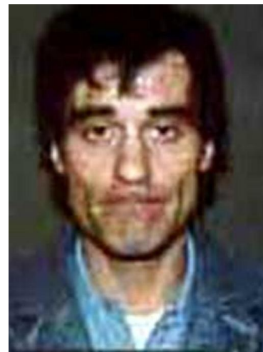
Photograph taken in 1986