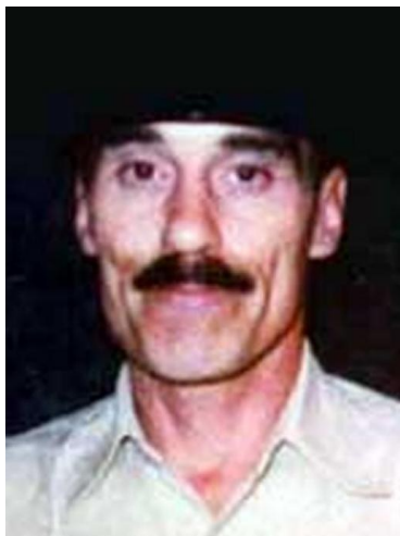
Photograph taken in 1991 or 1992