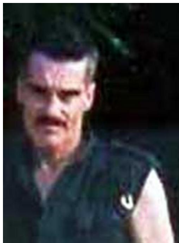
Photograph taken in 1991 or 1992