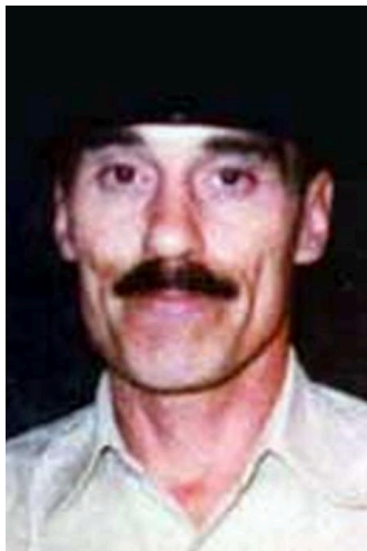
Photograph taken in 1991 or 1992