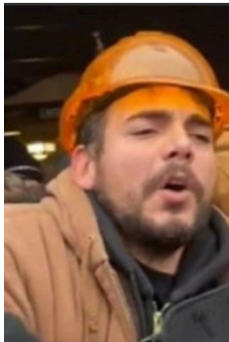
Photograph taken in 2021

Assaulting, Resisting, or Impeding Certain Officers Using a Dangerous Weapon or Inflicting Bodily Injury; Civil Disorder; Theft of Government Property; Entering and Remaining in a Restricted Building or Grounds; Disorderly and Disruptive Conduct in a Restricted Building or Grounds; Disorderly Conduct in a Capitol Building; Impeding Passage Through the Capitol Grounds or Buildings; Act of Physical Violence in the Capitol Grounds or Buildings