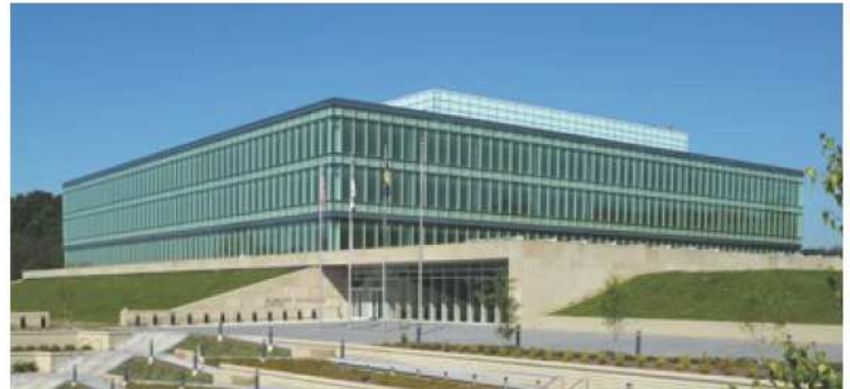
Biometric Technology Center (BTC)