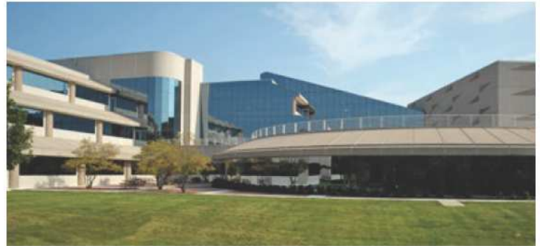
CJIS Division Main Facility