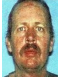
Photograph taken in 1999