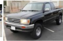
Example of 1997 Toyota Truck