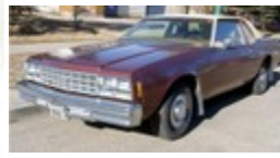
Example of 1977 Chevy Sedan